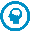
Tinnitus management program