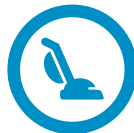
Noise filtering and reduction