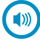
Automatic volume control and adjustment