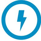
Reduction of sudden noises