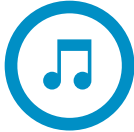
Special music program