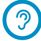
Sound reproduction similar to the human ear