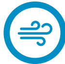
Special wind noise program