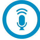
Directional microphones for noisy environments