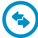
Automatic synchronization with in-stereo devices