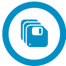
Multiple memories for maximum flexibility