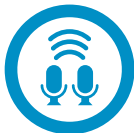
Adaptive multiple directional microphones for noisy situations